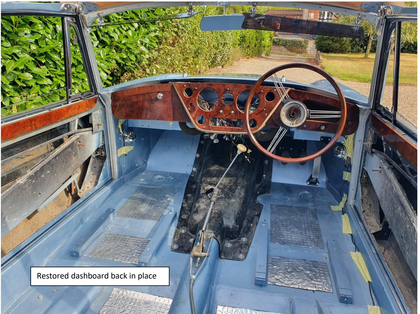
Restored dashboard back in place