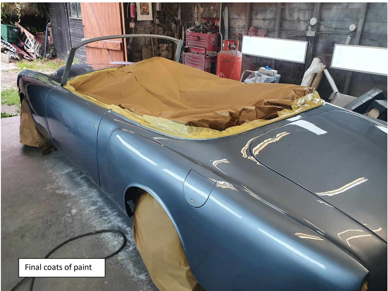
Final coats of paint