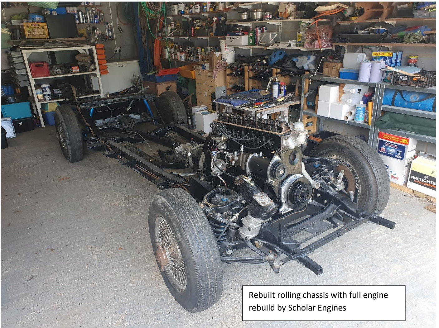
Rebuilt rolling chassis with full engine rebuild by Scholar Engines