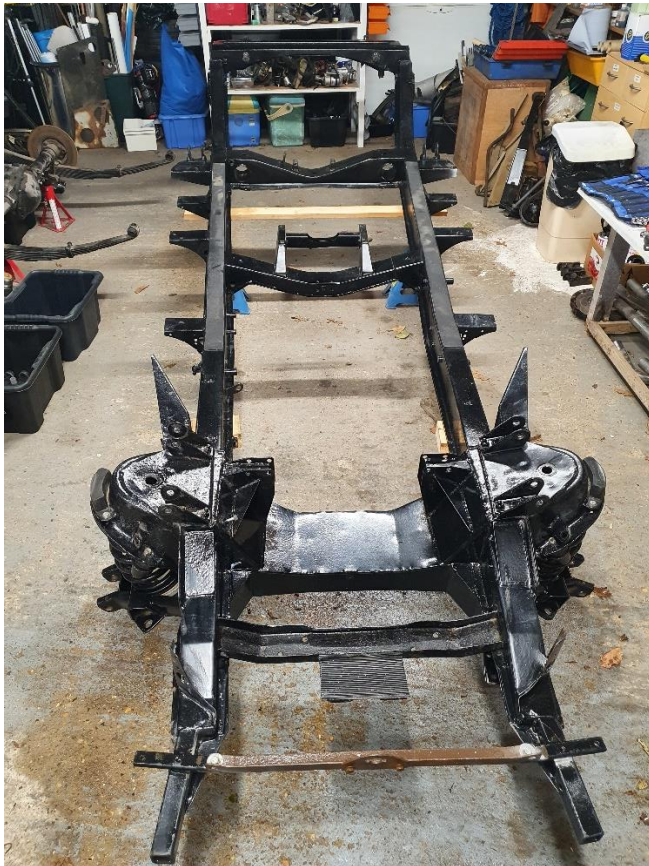
Chassis stripped and looking good