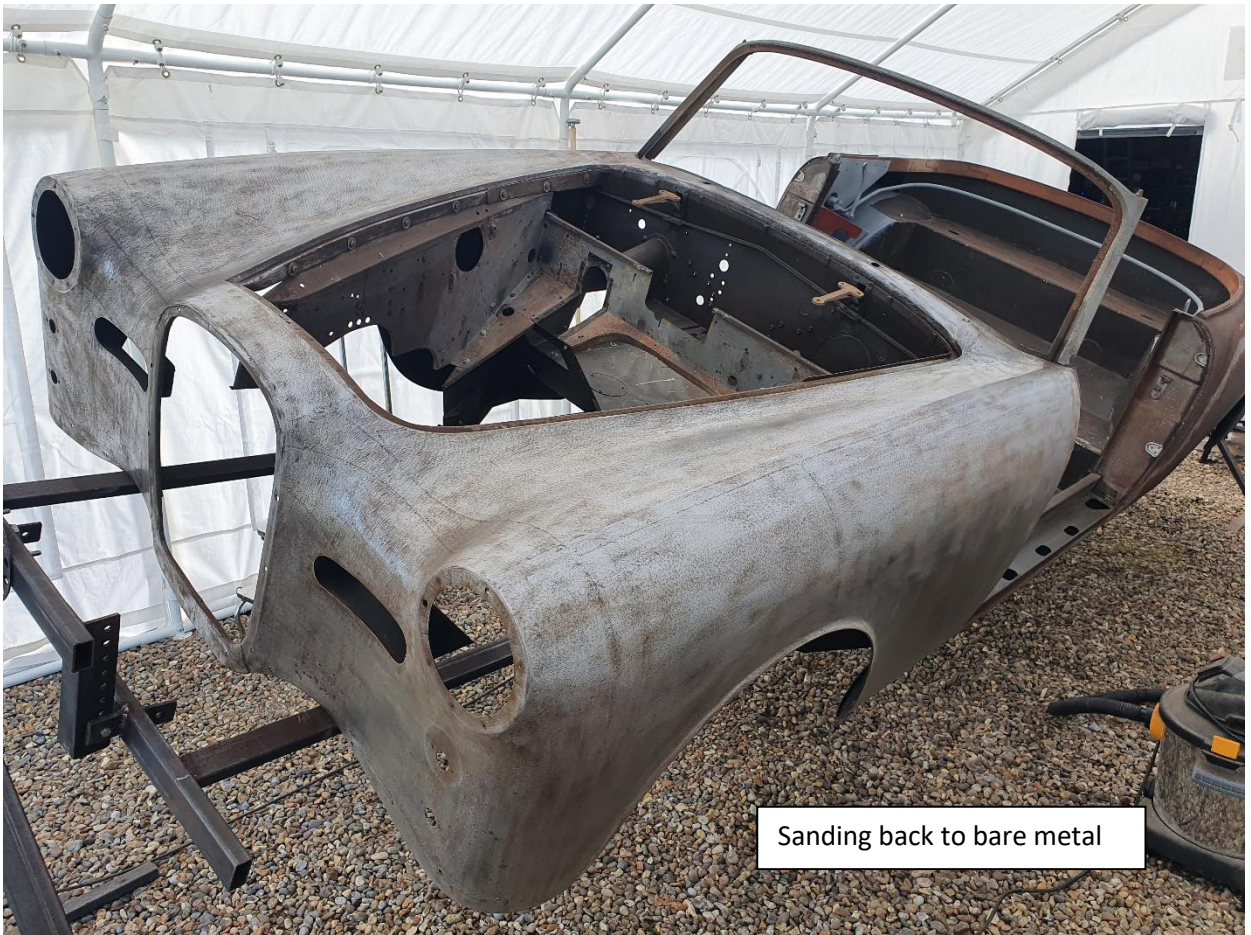
Sanding back to bare metal