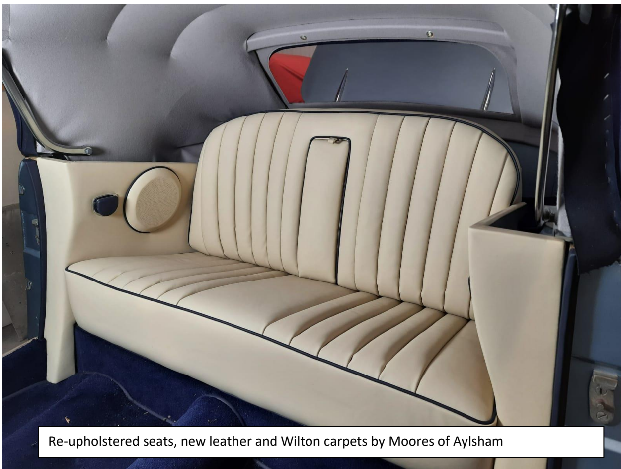
Re-upholstered seats, new leather and Wilton carpets by Moores of Aylsham