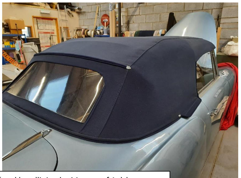
New roof and headlining by Moores of Aylsham