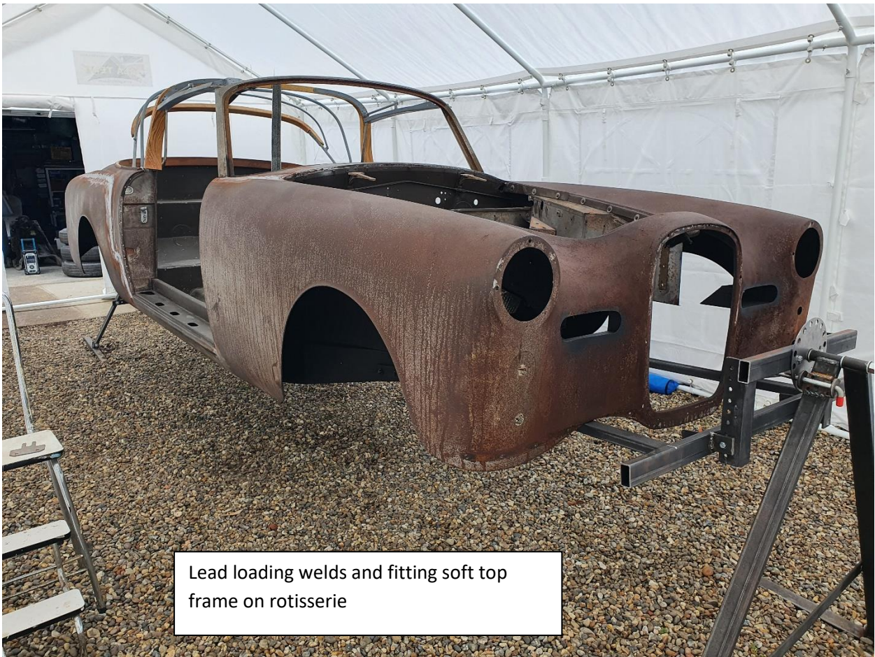
Lead loading welds and fitting soft top frame on rotisserie